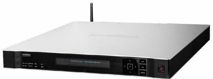
Antenna Control Unit (19" Rack Type 1U)