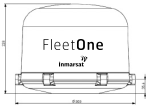
Fleet One Above Deck Unit (ADU)