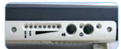
Front view, close-up

The rugged design of the 9201 allows the terminal to be installed outside in extreme weather conditions for extended periods of time. Multiple user support allows your entire team to share a single 9201 simultaneously, providing the site with a broadband local area network. The terminal's small size and weight allows you to easily move it from site to site and be connected again within minutes. When you're at a remote site, sending and receiving the information you need is critical. The Inmarsat BGAN service, together with the 9201, offers a true alternative network that enables corporate teams to communicate their critical information—anywhere, anytime.