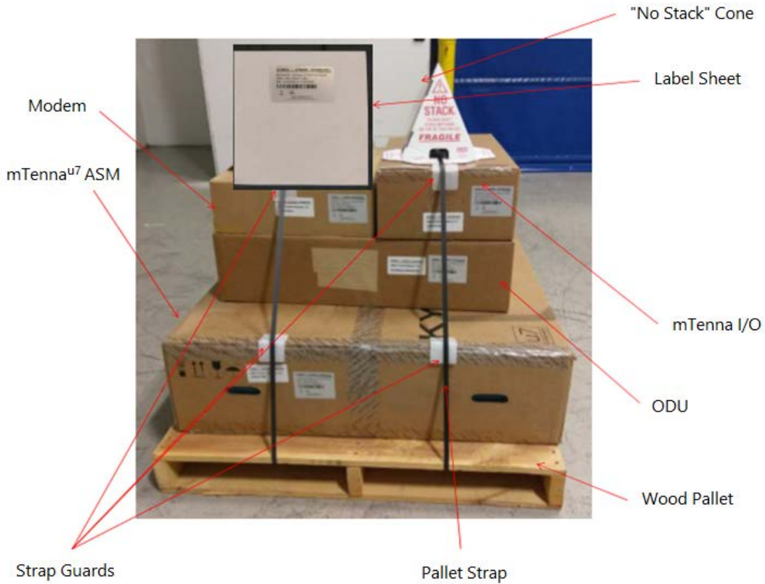
Figure 1: 800-00007 / 800-00009 one KyWay terminal pallet configuration